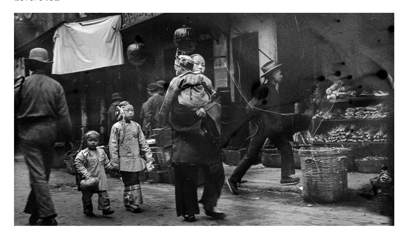
A photo of Chinatown in San Francisco, California, around 1900. This was before the San Francisco earthquake ruined many of the buildings.

By History.com, adapted by Newsela staff on 06.07.17 Word Count 457 Level 540L